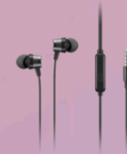
Lenovo Analog In-Ear Headphones Gen II Bulk Package (20pcs) 4XD1T54899

Please click here to view the full list of accessories.