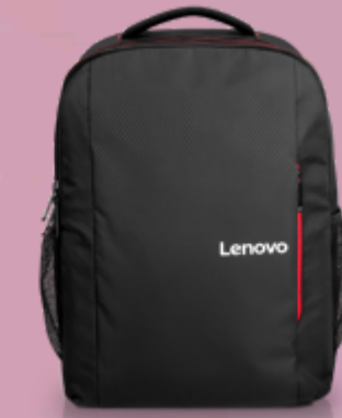
Lenovo 15.6 Laptop Everyday Backpack B510-ROW 4X41U80414