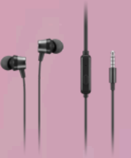
Lenovo Analog In-Ear Headphones Gen II Bulk Package (20pcs) 4XD1T54899