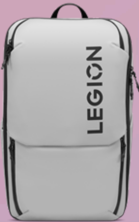
Lenovo Legion 17" Gaming Backpack GB800 (Light Gray) GX41U39300

Please click here to view the full list of accessories.