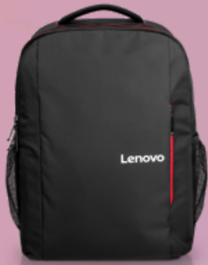
Lenovo 15.6 Laptop Everyday Backpack B510-ROW 4X41U80414