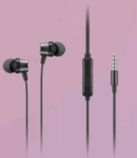
Lenovo Analog In-Ear Headphones Gen II Bulk Package (20pcs) 4XD1T54899

Please click here to view the full list of accessories.