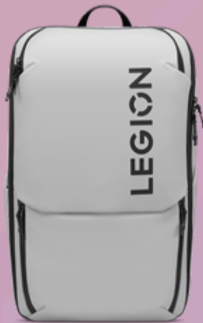
Lenovo Legion 17" Gaming Backpack GB800 (Light Gray) GX41U39300

Please click here to view the full list of accessories.