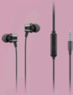
Lenovo Analog In-Ear Headphones Gen II Bulk Package (20pcs) 4XD1T54899